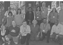
THE 2009 UNISON DELEGATION.