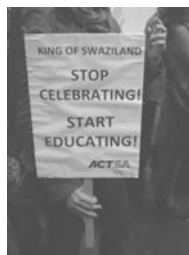
ACTSA DEMONSTRATION OUTSIDE THE SWAZILAND HIGH COMMISSION.

ACTSA continued to highlight the European Union's unfair trade agreements with southern Africa. In August, we launched a new briefing and action on Economic Partnership Agreements, highlighting the concerns of trade unions, civil society and governments in the region about the deals.