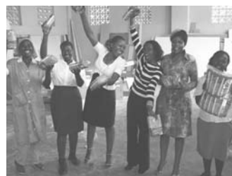
WOMEN IN ZIMBABWE RECEIVE SANITARY PRODUCTS AS PART OF ACTSA'S DIGNITY! PERIOD. CAMPAIGN.